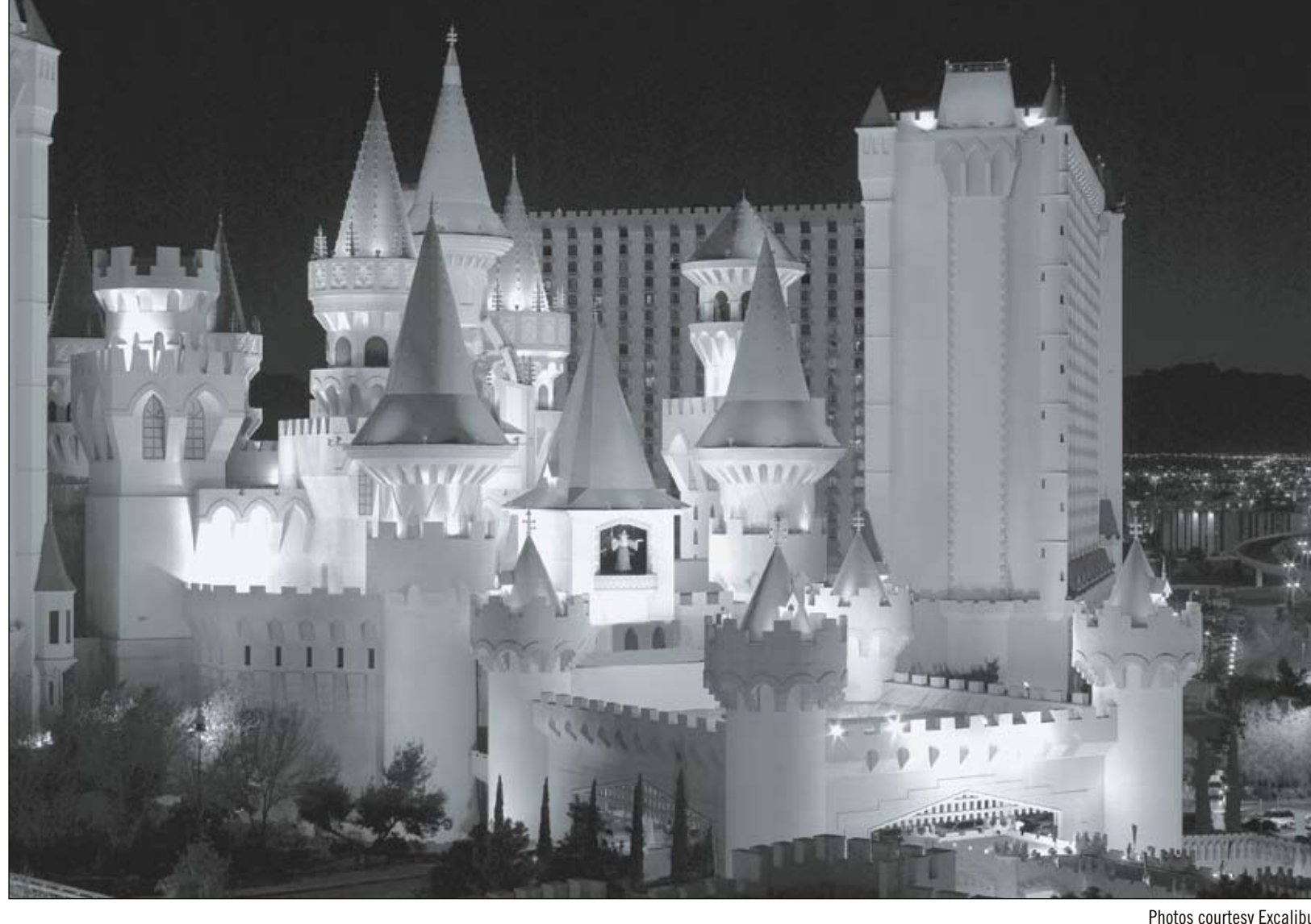
Even though Excalibur Hotel Casino offers plenty of new ways to keep adults amused, the resort hasn't forgotten its medieval roots and castle façade, above. Top, the widescreen rooms feature plasma televisions, iPod docking stations, pillow top mattresses, contemporary bathrooms with granite countertops and alarm clocks with iPod inputs among other amenities.

West said that the hotel and Dick's Last Resort complement each other nicely.