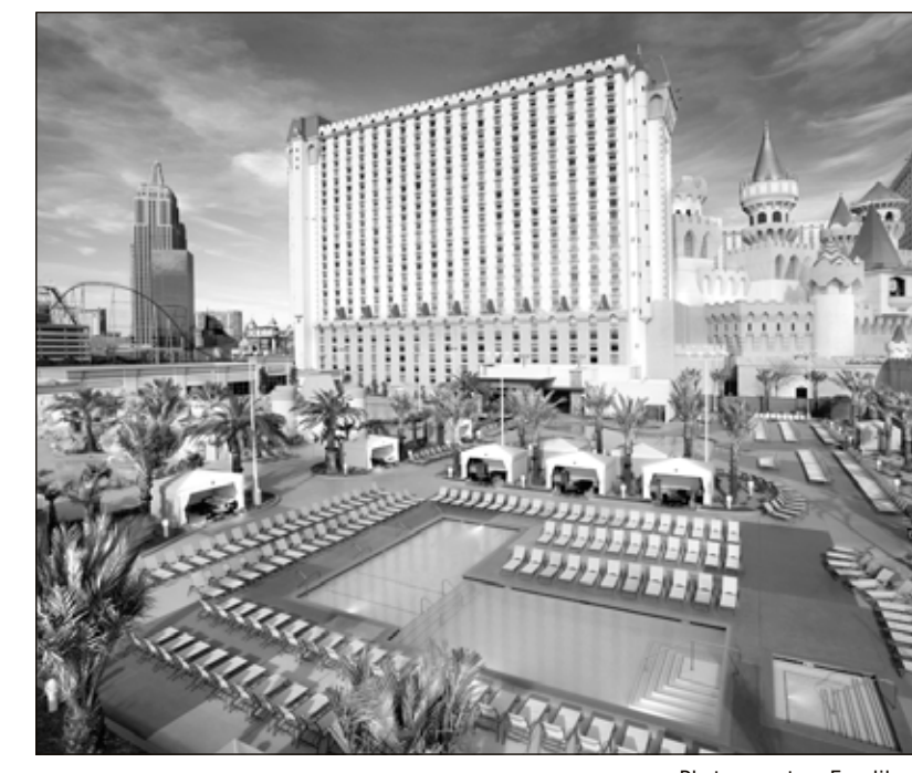
The pool at Excalibur underwent a facelift, doubling its size and adding cabanas, a fire pit, sun decks and a secluded relaxation pool.