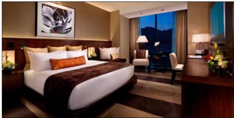
The rooms at Aliante are decorated with all the modern conveniences of the finest hotels.

center bar, ETA Lounge, stands in the middle of the action. The casino perimeter is lined by the property's restaurants, such as MRKT seafood, Camachos Cantina and Pips Cucina & Wine Bar, as well as the 700-seat Access Showroom and the cinema. Parking is easy with more than 3,000 spaces in the garage and almost 2,000 more outside the garage.