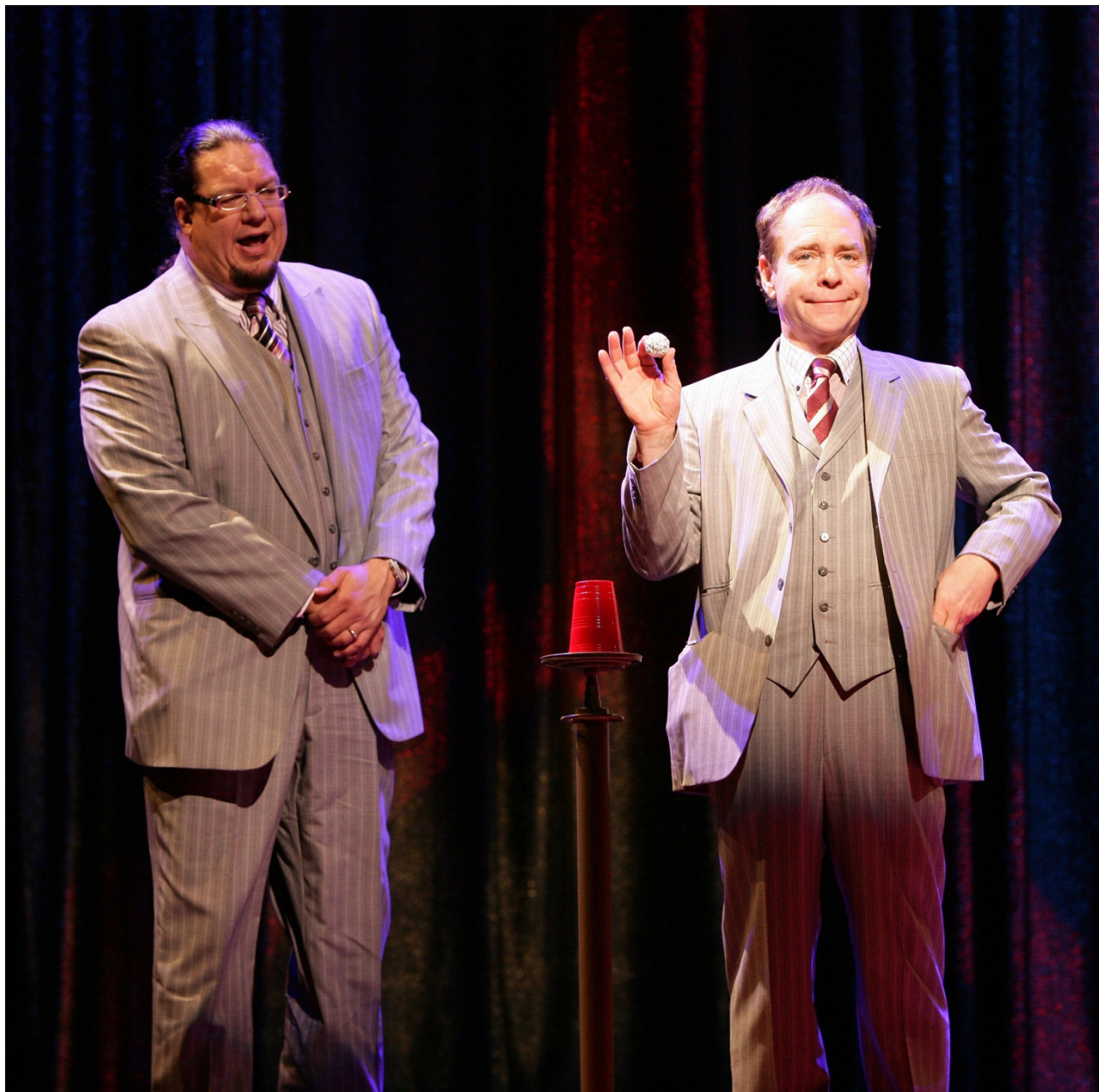
In their show at the Rio hotel in Las Vegas, magicians Penn & Teller perform a quick four-handed cups and balls routine. Then they do something even trickier: Explain to the audience exactly how it's done.