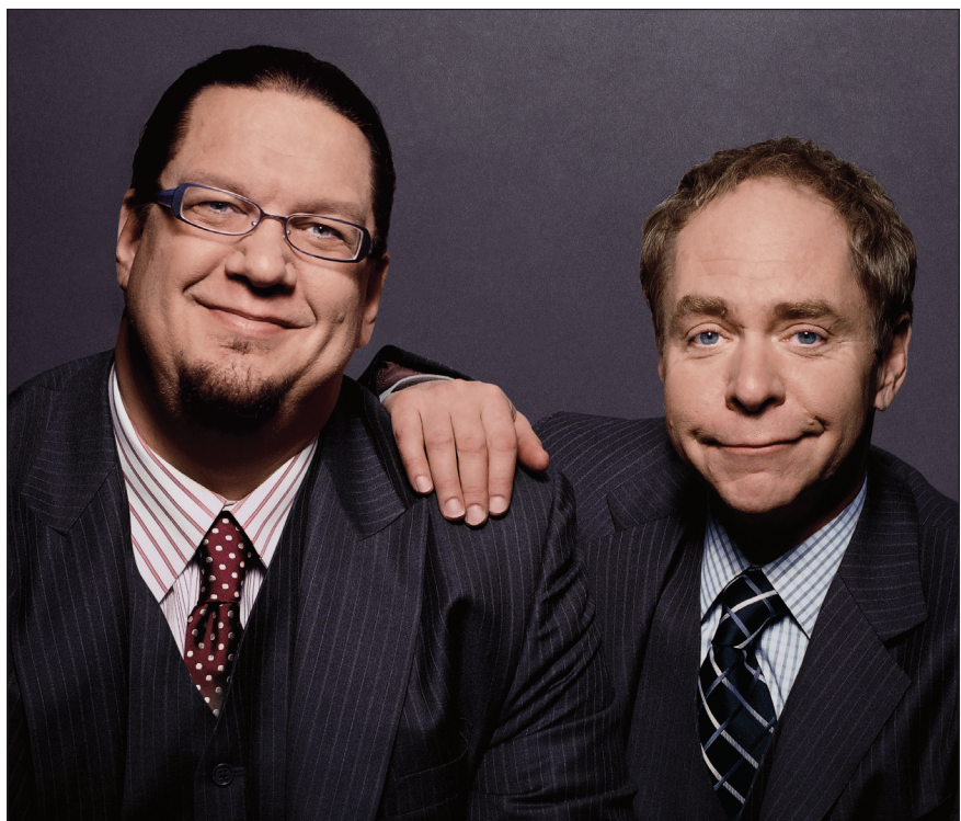
Magic partners for more than 35 years, Penn Jillette, left, and Teller, create an interesting experience for the audience when explaining how an illusion is done.

"Both are valid choices but it takes a tremendous amount of discipline for someone to say, 'I'm cool enough that I'm not going to take the easy way,'" he said. "I know one person who saw the show three or four times, and kept his eyes closed every single time. You've got to admit, you've got to be a very cool person to do that."