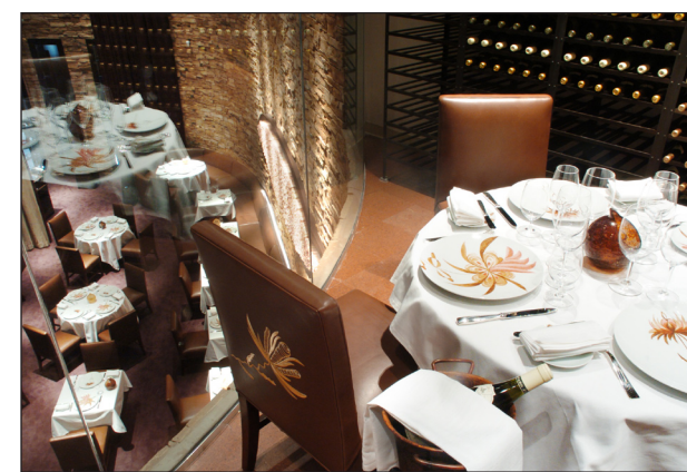
The cellar master's table at Fleur de Lys inside Mandalay Bay.

Private Dining Room: The Pagoda Table (seats 12). Minimum: $170 per person / $2,000 total. Big Night Out: Upwards of $2,000.