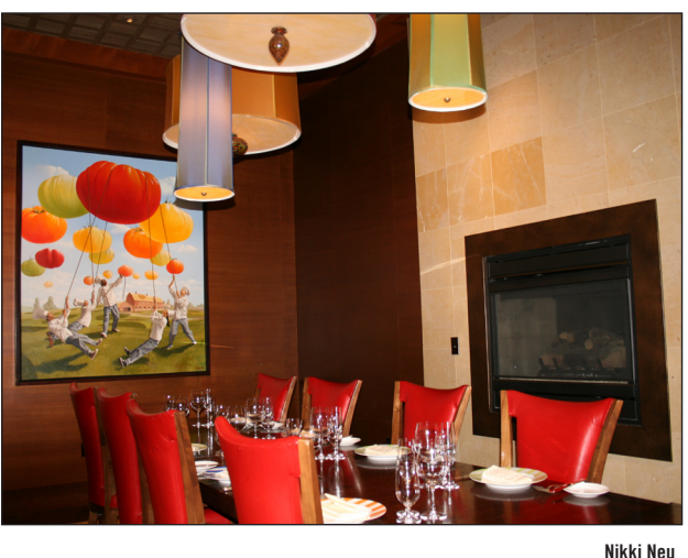
Private dining room at Bradley Ogden.

Big Night Out: Money won't get you in this room, you're going to have to earn it.